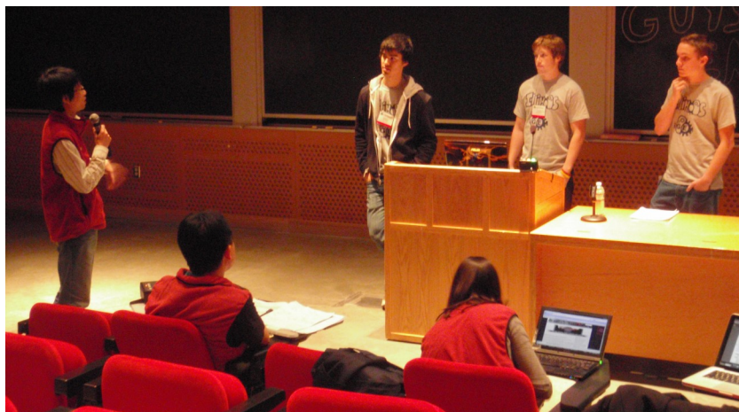
Members of the Tools team field a question from a judge during their presentation at the 2010 Jamboree